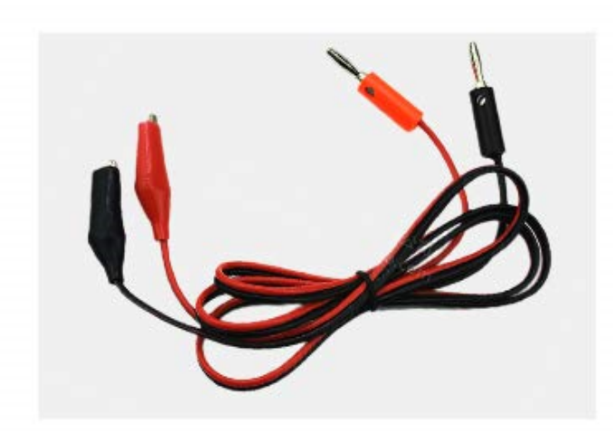
22" long line with clips,composed with 25 copper wires